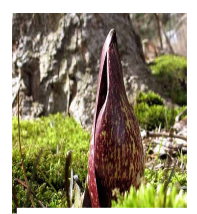
Skunk Cabbage blooming now

Our native plant and pollinator pairing for the month [April] is skunk cabbage (Symplocarpus foetidus) and common green bottle fly (Lucilia sericata). Skunk cabbage is a fascinating and odd species of native plant. The plant uses a process of thermogenesis to melt and push through the late season snow and ice. The increased temperature that radiates from within the flower provides a very hospitable environment for the pollinators who arrive in early spring. Additionally, the flower gives off a pungent fragrance, varying between scents of rotting meat, garlic, and apple, to attract specific pollinators such as the common green bottle fly, which mistake it for carrion. Flies, often overlooked, are fantastic pollinators for not only skunk cabbage but also for many