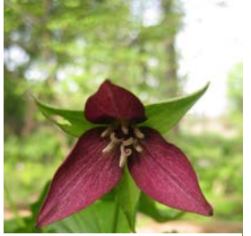
Trillium erectum

The genus name comes from the Latin word "tres" (meaning three), which reminds us that all trillium share a similar structure: leaves, petals, and sepals all come in groups of 3. The rhizome sends up a single stem of 12-18", topped by a terminal whorl of 3 leaves. Some species produce the flower on a stalk (known as "peduncled") while others lack a stalk (known as "sessile"). The species name means "upright" to indicate that it is "peduncled, " with the flowers growing on stalks.