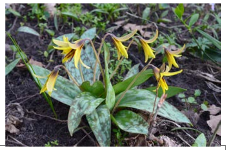
Trout Lily.

Trout Lily, Erythronium americanum (March) This Spring ephemeral native to our region bears a delicate yellow flower that hangs slightly down. Before