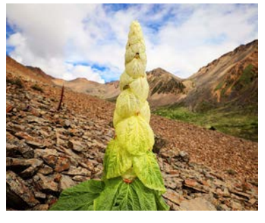
Rheum nobile (sikkum rhubarb)

region. Yunnan province is legendary as a region of immense interest to botanists and alpine gardeners. It is home to rhododendron, meconopsis, the famed blue poppy and easily 130 species of primula. The area's magnificent plants grow in dramatic surroundings, making it one of the most beautiful places on earth.