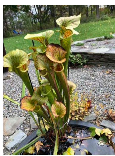
Saracena flava, nonnative and possibly hardy

For the planting medium, use either 100% baled peat moss (which is just dried, compressed sphagnum) or peat moss and acidic sand. You can find acidic sand (i.e. usually quartz) at a big box hardware store in 40 pound bags. Quartz sand is usually tan or brown. If you're not sure the sand is acidic, check the pH with a pH meter (a minor expense if you're going through all this trouble of creating a bog). Different opinions vary on using solely peat moss, a base of sand with peat moss on top, or peat moss mixed with sand. In any case, I suggest if using a mix, to use a much higher proportion of peat to sand. In nature, bog plants are growing in a thick spongy layer of peat. Avoid coir, which has a slightly acidic to neutral pH, or Michigan peat, which is basically composted sedges. Peat moss is