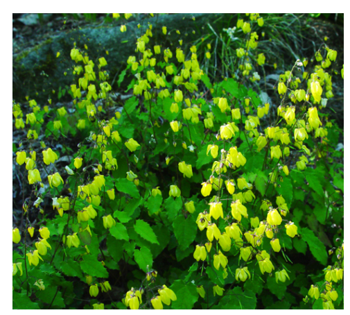
Epimedium x 'Lemon Zest'

Epimediums are easy to grow, long-lived shade perennials that thrive in well-drained, humus-rich, moisture retentive soils. Although many species grow in limestone soil in China, they also have grown very well in the slightly acid soils of north central Massachusetts. The deciduous species native to Japan (and sometimes Korea) E. diphyllum, grandiflorum, and sempervirens, grow on slightly acidic soils in their native habitat. They can be planted in partial sun (with adequate moisture) in northern latitudes; but need more shade further south. Too much sun will scorch the leaves, making