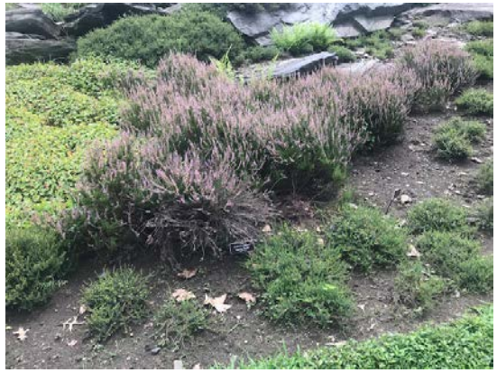
Heathers at New York Botanical Garden (NYBG)

with the idea that these semi-shrub plants work as a specimen plant in a garden as well as a green carpet with an almost ethereal bloom of pink, red and white flowers. Consider a mix of heathers that include single or double blooms and the delicate bud bloomers. Once established their maintenance is minimal. But do not shirk watering especially during the first year. Water through the fall, being careful not to oversoak any added peat moss later in the year. This may lead to frost heaving. These plants have tender roots close to the soil surface and are susceptible to the winter freeze