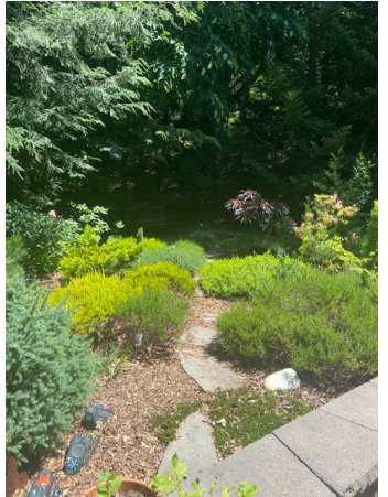
Frank's heather garden

All heaths and heathers grown in our area require winter protection. If left exposed, they are at risk for desiccation in the winter from sunlight and wind. The recommendations are to cover the plants with leaves in the late fall about the time the ground freezes. Oak leaves have less fungal problems, are slightly acidic and allow moisture to pass through. The leaves should be removed early in the spring. Erica carnea , also known as winter heath, may be in bloom when the leaves are removed.