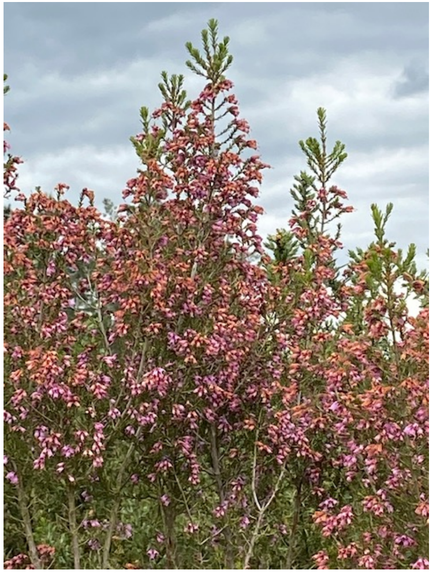
Native heathers growing in northern Spain

Growing habits of Ericas/heaths include: