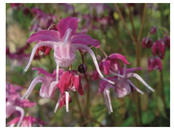
Epimedium grandiflorum 'Bicolor Giant'

Bring your own bag lunch at noon and enjoy the opportunity to socialize before the program and Chapter meeting begins at 1:00 pm.