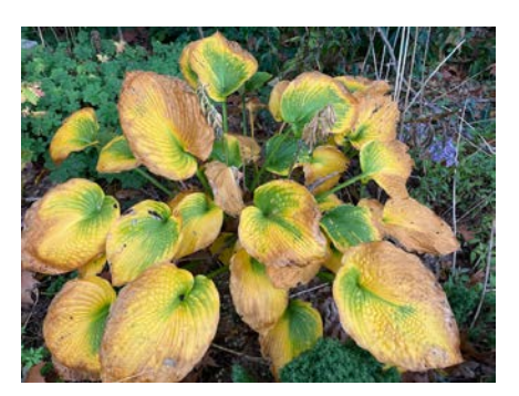
Hosta 'Rhino Gold'

of the Month, it's now peak fall color, and just last week I finally received the residual funds held by Cornell, i.e. registration funds leftover after all the bills were paid. I