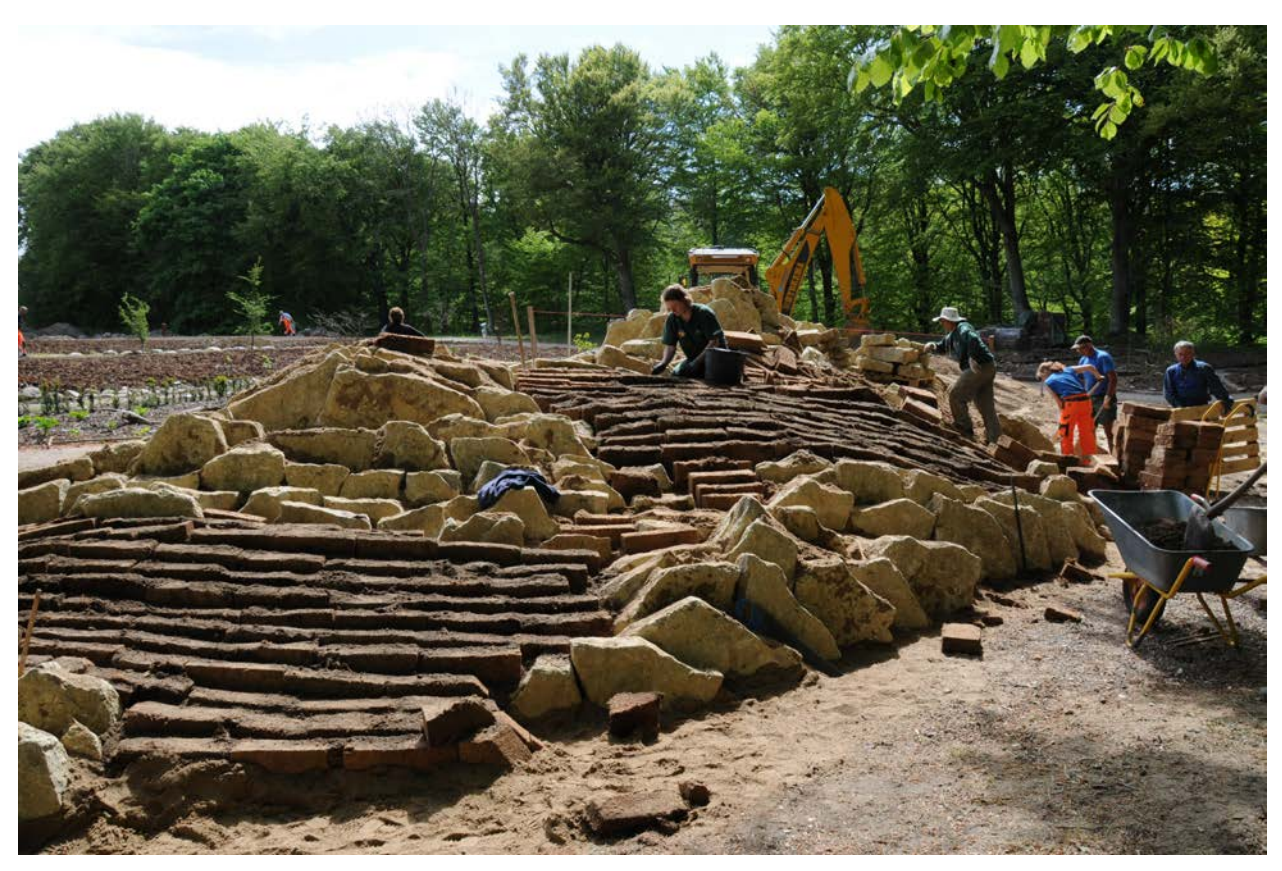
Bangsbo Crevice Garden under construction.

***NOTE**** This meeting is being held at the Tompkins County Public Library East BorgWarner Room AND on Wednesday October 12th. Tompkins County Public Library is located at 101 East Green Street. (click for the map). The Library will be open. At the main entry on Green Street the BorgWarner Room is to the left past the stacks, following a wide aisle that parallels Green Street. The room is conveniently located across from the restrooms.