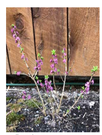
Daphne mezereum Carol Eichler

May 14: ACNARGS Members Only Plant Sale, Myers Park Pavilion B, Lansing NY (see article for details); set-up begins 9a.m., sale begins at ~11a.m. followed by lunch and optional visit to the Stark/Stauble garden nearby