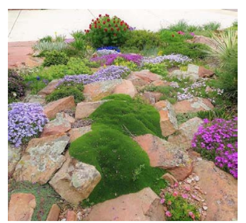
Anne Smith's alpine rock garden

You never know what reaction you'll get when you tell people you're a "rock gardener." "Do you try and grow rocks?" is one of the stranger responses. Most everyone becomes infatuated with stones at some point in their lives, and most people have a little gathering of pebbles they've amassed on trips hither and yon—a stone from Italy, a rock from Wyoming. I've even seen gardens planted among these heterogenous heaps of stone—not what most of us like to have associated with our art!