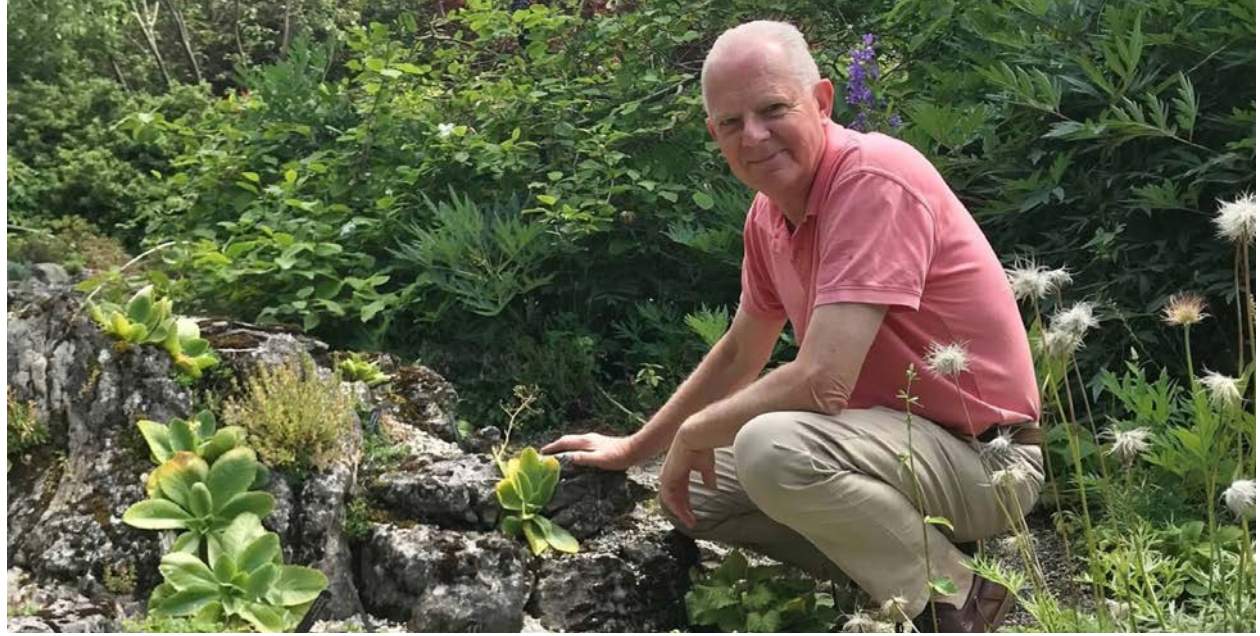
Our April meeting presenter will be one of the most renowned gardeners in Scotland -