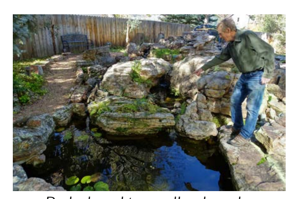
Radenbaugh's woodland garden

I know rock gardeners who live in apartments far above street level, who enjoy going to