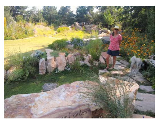
Scott's boulder steppe garden

This May the Rocky Mountain Chapter will tour three gardens: one filled with choice alpines—Gentiana acaulis in large drifts of cobalt color, huge mats of Daphne arbuscula