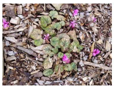
Cyclamen coum P. Curran

species (not all leaves were damaged, perhaps just the older ones). I think what happened is that the snow blanket wasn't thick enough to insulate those leaves during the first cold spell. Since some people cut the last season's hellebore leaves off before bloom time, losing the leaves won't be a problem.