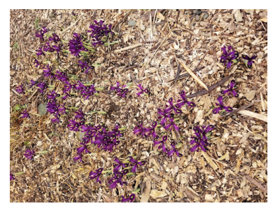
Iris reticulata Pat Curran

The Master Gardener part of the Sale will be radically different. Because of the challenges imposed by the invasive jumping worms, MG's will not be donating and potting up plants from their gardens. Barerooting, triple washing, potting in sterile potting mix, and then storing the potted plants up on tables made it too arduous to continue our traditional donations of tried and true plants from MG gardens.