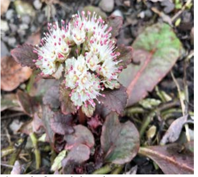
Look for this plant at our sale - Chrysosplenium macrophyllum blooming now

We have once again decided to limit our May plant sale to members only. It will be held May 14th at Myers Park in Lansing. We have held successful members-only sales last year and loved the informality and relaxed nature of the event plus we got to gather for some much-missed socializing. The broad selection of plants was also amazing! Note the Park charges admission for non-residents of the Town of Lansing.