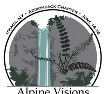
Alpine Visions EXPLORATION AND INSPIRATION NARGS

Save the Dates: June 14–16, 2022 is coming! We're going to try again! We're hosting 2022 NARGS Annual General Meeting on June 14-16, 2022. Our theme - Alpine Visions: Exploration and Inspiration - is similar to last time but with minor modifications: Cornell Botanic Gardens will again co-host with us. You will see us welcoming a line-up of plant explorers as our speakers and we hope you'll be as excited about them as we are.