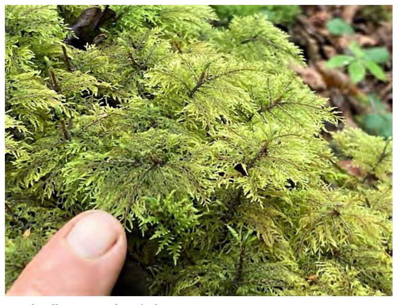
Lush tall moss, unidentified species

So now I'm going to start talking dirty! Like most avid gardeners, soil is something I'm thinking about much of the time. I admit I may be at little obsessed at times, though in the past I wasn't obsessed enough about my rock garden soil to ensure adequate drainage. The first presentation in the November NARGS Rocks presentation was also soil obsessed and added a very large amount of organic matter to her sandy soil to ensure it would keep her woodland plants happy. The natural topsoil where I am is a silty loam, perhaps slightly heavier than the perfect loam, and slightly alkaline at pH 7.5. Some areas in my gardens have more challenging soil due to digging for the leach field in one area, and rocky fill in another area. Near the leach field the soil is more clayey, so I've added both sand and organic matter (compost and coir). Where there was rocky fill, the drainage was good, but this was an area with shade or part shade where I wanted to grow woodland plants. Changing the soil in this area was a longer