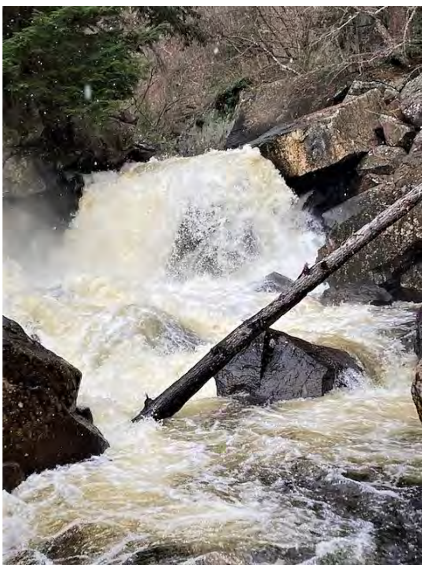
High falls on the West Branch Sacandaga River, Wells, NY

project; I removed the cobbles and stones down to a foot or 15 inches; added topsoil and sand, and added organic matter, including compost, old potting mix, coir, and occasionally peat moss. The goal was a porous soil fairly rich in organic matter, and the goal seems to have been met, after many bags of amendments. Primulas, ferns, and other shade loving perennials are doing well. Both of these beds are mulched every year, which helps to replenish the organic matter lost through oxidation. Standard advice for amending clay soil is not to add sand and just add organic matter. I believe if you have clay soil that adding sand can be helpful if added along with significant amounts of organic matter. Warning: if you're amending soil with not fully composted horse manure or wood chips, these can create a nitrogen sink in your soil (i.e. the wood chips or manure, which usually contains wood chips or sawdust, will tie