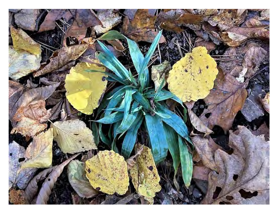
Blue leaved sedge (Carex? platyphylla) with yellow leaves

Coming up in January 2022: we plan to have a meeting via Zoom, so keep checking your email for details. Also, for NARGS members, you will be able to order seeds from the NARGS Seed Exchange starting December 15; the list of seeds available is already up on