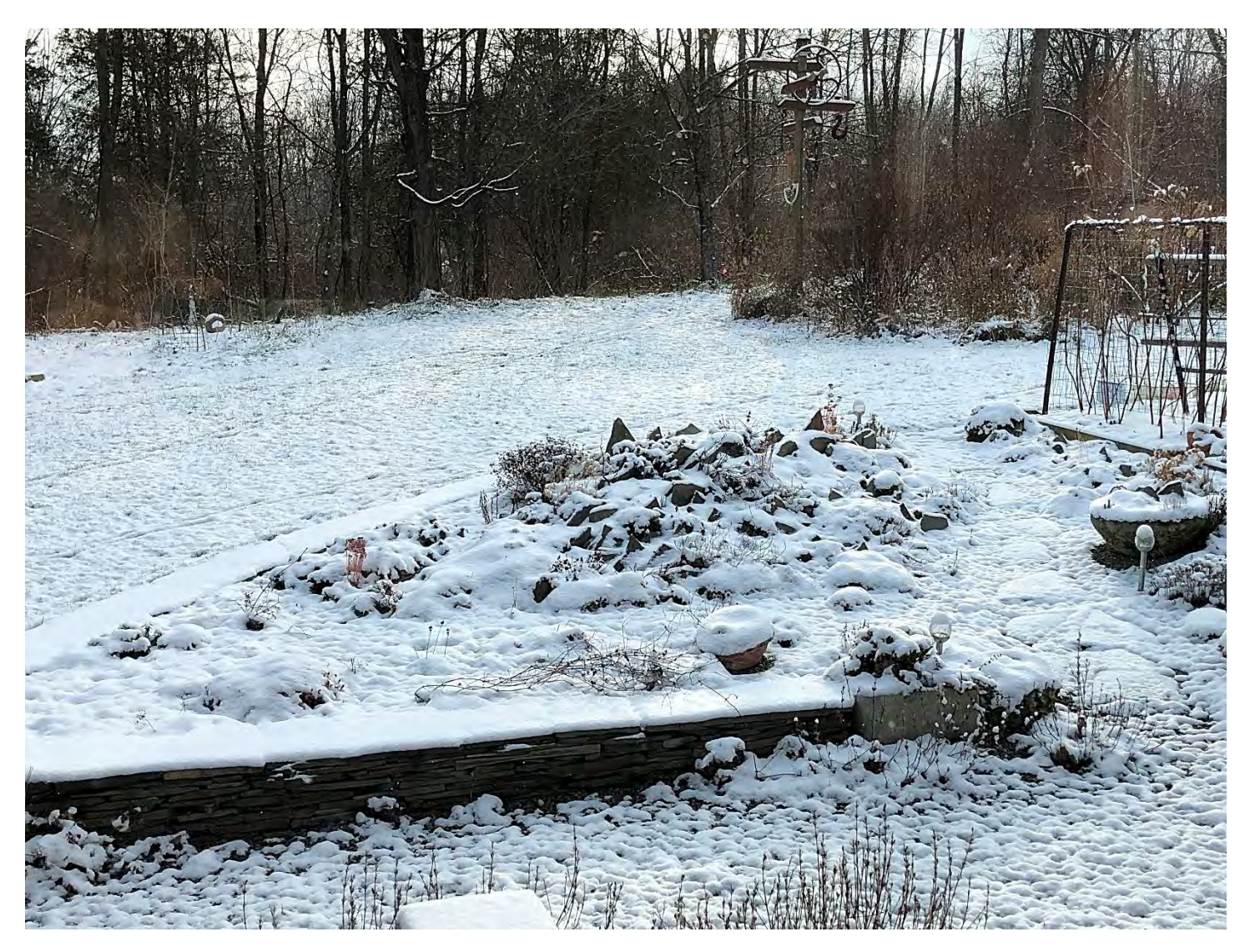
Carol Eichler's rock garden in December.