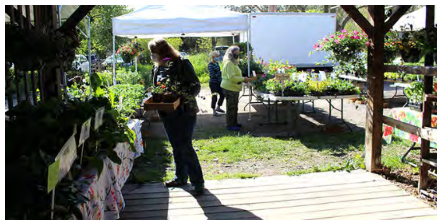
2020 Plant Sale; Image by Sandy Repp

While we will not be selling plants at the Cooperative Extension's annual Garden Fair and Plant Sale, we plan to have an information only booth. This opportunity to interact with the public is too great to resist. As we should all be aware, the Garden Fair is well attended by the greater gardening community. For ACNARGS it has served as a tool to recruit new members and inform others that we exist.