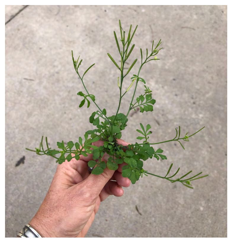
View of hairy bittercress plant from above.