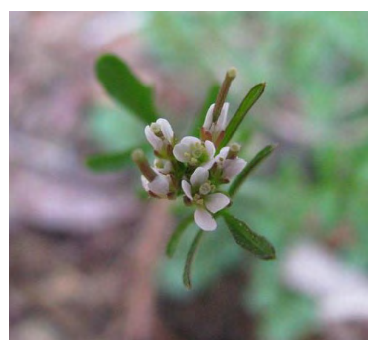
Hairy bittercress flowers.