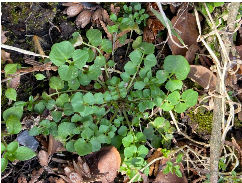
Hairy bittercress leaves.

Flowers/Fruit: Arranged in dense racemes, the flowers (2-3 mm ( \sim 1/10")in diameter) are relatively small and composed of 4 petals, 4 sepals, and 4 (sometimes 6) stamens. The fruit (1.5-2.5 cm ( \sim 1") long) is a flattened capsule (silique). Mature seedpods split open when disturbed, launching seeds up to 5m (15') from the plant.