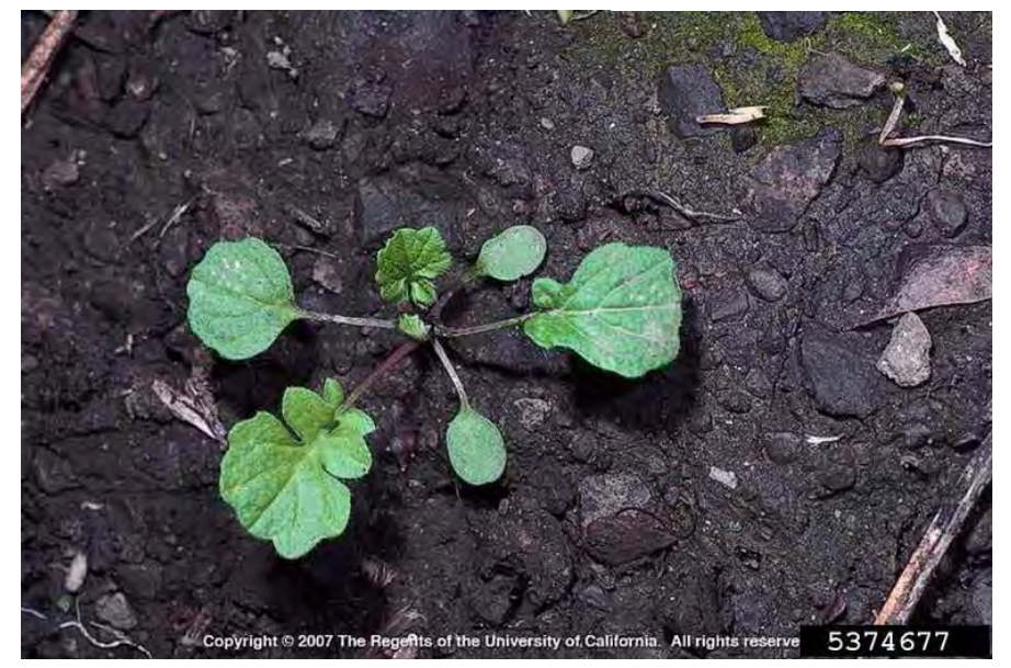
Hairy bittercress seedling.