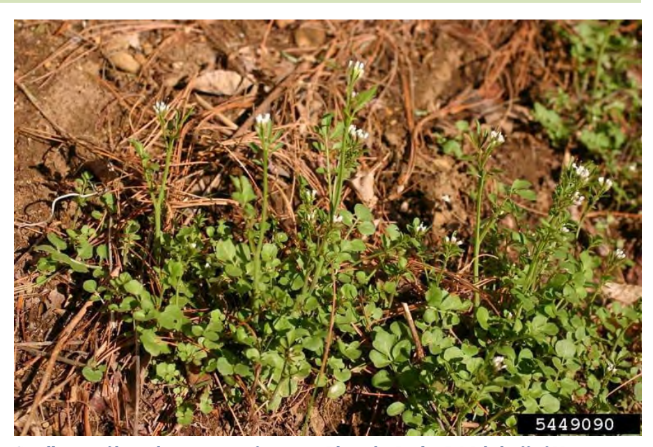
Small area of hairy bittercress infestation.

Hairy bittercress is one of 3000+ species in the mustard family. For help identifying weedy mustards either in the rosette or flowering phase, please visit our mustard identification page.