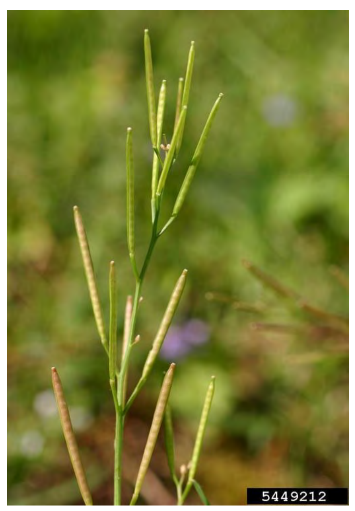
Hairy bittercress fruits.

Mechanical management such as cultivation/tillage or hand removal has shown to be the most effective in controlling hairy bittercress when the plant is young and at the beginning of an infestation. The best times for management are early fall or early spring before the plants begin to set seed.