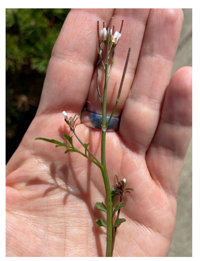
Hairy bittercress stem.

Mature plant : Stems are smooth, angled, and typically branched towards the base. Flowers are mainly present in mid to late spring, and individual plants flower continually through the flowering period. Flowers form at stem ends, with seedpods forming lower on stems. Root systems are shallow and fibrous rather than taprooted.