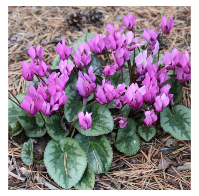
Cyclamen purpurascens.