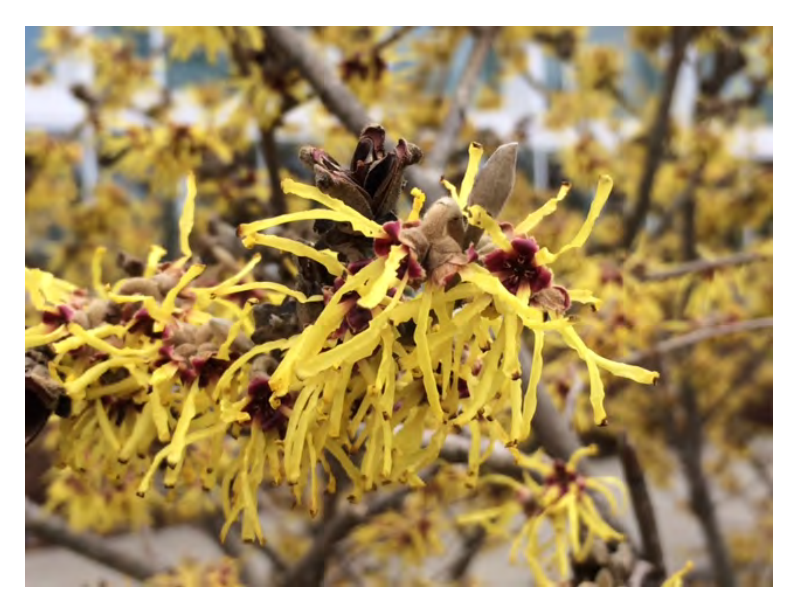
Witch hazel at Cornell (Hamamelis x intermedia) on March 16.

Some of the worthy natives you can plants are oaks (Quercus sp.), black cherry (Prunus serotine), dogwoods (Cornus florida and alternifolia), spicebush (Lindera benzoin), buttonbush (Cephalanthus occidentalis), honeysuckle vines (Lonicera serotina and periclymenum), native asters and goldenrods (sticking to old genus epithets, Asters nova-angliae, oblongifolius, Solidago speciosa, rugosa, ridiga), coneflowers (Echinacea purpurea and pallida), lobelias (L. cardinalis and syphilitica), milkweeds