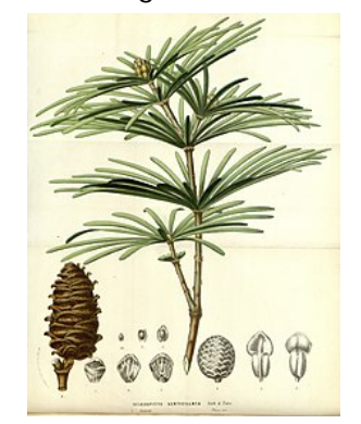
Umbrella Pine

And then there is the genus Chamaecyparis, false cypress, of which we can grow many species. There is one native nearby, C. thyoides , known as the Atlantic white cedar hardy to zone 4, and native to the eastern U.S. swamps.