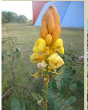
Senna alata, Candlestick Tree, native, medicinal

Some tropical plants encountered in Panama; photos by Carol Eichler