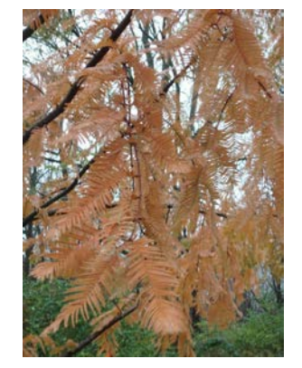
Dawn Redwood in fall color

https://smallfarms.cornell.edu/2019/02/11/arent-they-all-just-pines-how-to-id-conifer-trees/ As gardeners, we will encounter many non-native trees too and hope to be able to ID them. So I will make some additional comments.