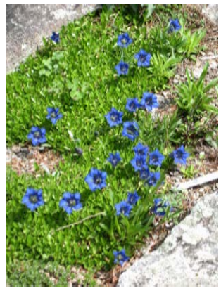
Gentiana acaulis 'Trotters Variety'

Since it's hard to do any outdoor gardening now, it's a great time to order some plants for spring. We're working on ordering a Plant of the Month (POM) for both March and April. From my time as the POM Coordinator, I remember it was challenging to find vendors who would agree to ship plants in time for the March meeting, and then follow through in time. Milder climate places like Santa Fe or Seattle don't have much trouble with plant readiness, but the unpredictable weather makes some vendors uneasy about shipping. Please be patient with the process, and if we're not successful with getting the POM out in March, we'll double up in April.