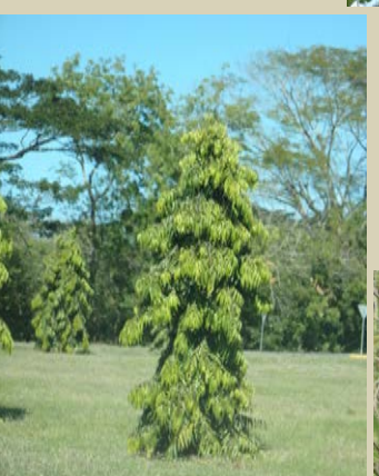
Polyalthia longifolia 'Pendula,' India Mast Tree, not-native landscape tree