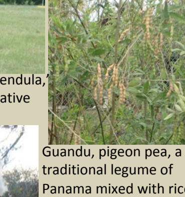
Panama mixed with rice: woody perennial

Allamanda schottii Bush Alamanda, native to Brazil, naturalized