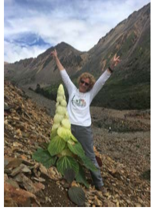
Rheum nobile shown in perspective

Rather than hunkering down to avoid the cold and wind, this extraordinary giant survives the elements by taking the opposite approach. It has evolved a big, bold system of shields, developing its own self-contained, multifunctional "'greenhouse." The tower of hand-sized, translucent overlapping bracts hold in warmth, while allowing in visible light during the short growing season. The bracts selectively