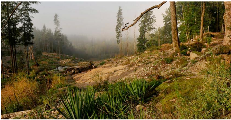
Peter's Sloping Rock Garden.

So to develop his own rock garden he removed all the soil from a very large sloping area of at least several hundred square feet (earning him the epithet of "Human Excavator") until he hit bedrock, a granite-like igneous, in this case. For his planting medium he used a granitic-type sand with a particle size of 0 to 0.8 cm (0.3 inches), which he applied in a layer at least 8 inches deep over the bedrock.