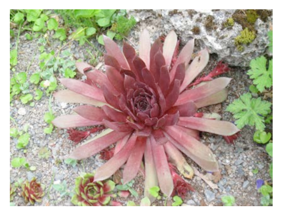
More semps grown in a sand bed

Two opuntias, prickly pear cacti, I am eager to try are yellow flowered O. humifusa and hot pink flowered O. polycantha , native from North Dakota to Alberta and south through Arizona and Texas. And yes, they are hardy.