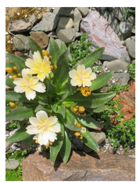
A happy Lewisia growing in a trough

Cacti, yuccas, delospermas, agaves and talinums generally have their growth spurts when temperatures are above 60 degrees and will do best in full sun. Lewisias, sempervivums and some sedums may need a bit of shade in the summer. Yucca nana, sometimes grouped with Y. harminaniae is hardy to zone 4 and is the smallest of the outdoor yuccas.