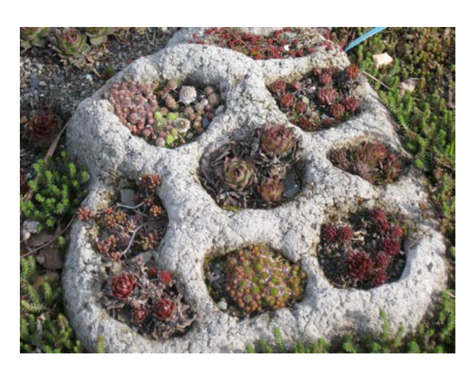
Hens and chicks (Sempervivums) prefer cool nights and need a cold dormant season to be healthy. They will thrive in heavy clay-based soils but also do well in sandy soils with adequate moisture. The variety of color ranges from burgundy to orange to yellow, green and silver and placement in a sunny spot brings out the color to best advantage. These plants are superb in pots and containers. Sempervivum arachnoidium is a tiny gem less than 6" high, originally from the Alps, and look like tiny eggs in a nest.