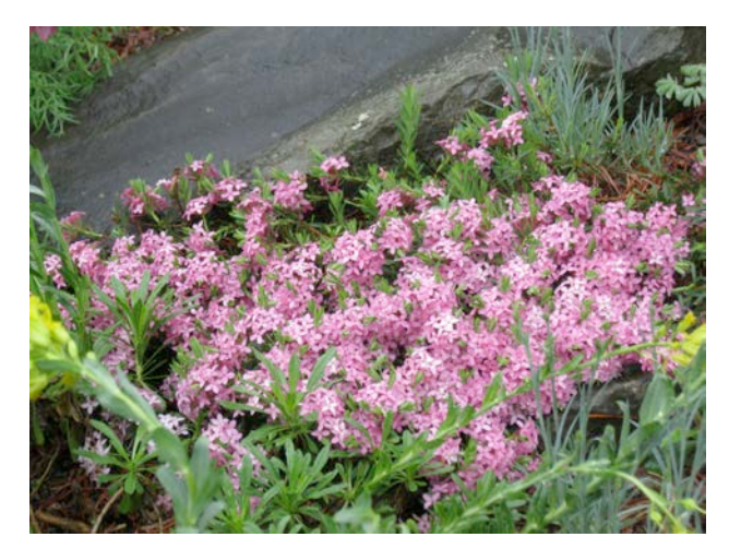
Daphne x 'Leila Haines' blooming in Wurster Garden (not yet this year)

Elisabeth Zander is well known in rock garden circles. She got hooked on rock gardens years ago when she helped set up at a plant sale of the Connecticut Chapter of