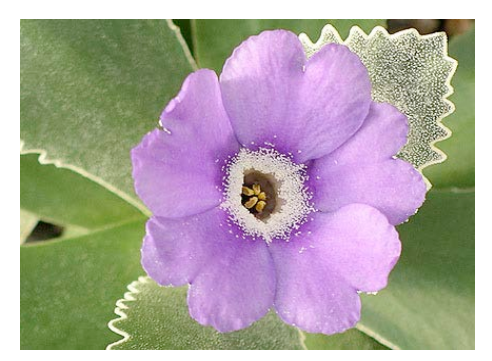
Primula marginata – NOTE this isn't the selection 'Wharfedale Bluebell', which would be bluer than this variety