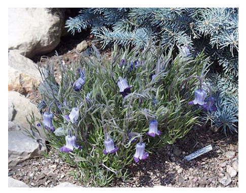
Clematis hirsutissima 'Bergen Park form'