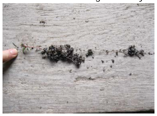
Seedling: Tiny, above ground plant with its 1<sup>st</sup> true leaves and its long root system

I'm hoping the seedlings will find good homes and that some will eventually show up on our tables at the May and August plant sales. The seedling exchange is a great way to learn about how to start and grow plants from seeds.