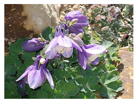
Aquilegia flabellate 'Nana'