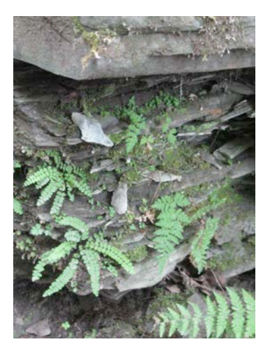
Asplenium trichomanes growing in a special niche

After a dish-to-pass lunch that noticeably favored desserts (no complaints were heard) several members chose to enjoy the coolness of the Buttermilk Creek gorge to do a little botanizing and work off some of those dessert calories! Among the plants we spotted were: Aralia racemosa , American spikenard; Adiantum pedatum , maidenhair fern; Asplenium trichomanes , Ebony spleenwort; Desmodium rotundifolium (perhaps?) round-leaved trailing tick-trefoil; Epigaea repens , trailing arbutus; Cystopteris bulbifera , bulblet bladder fern; Epipactus