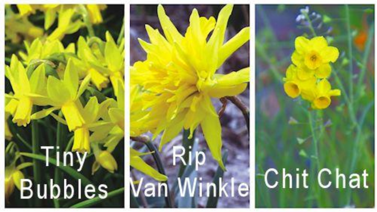
'Rip Van Winkle' is a double flowered heirloom daffodil from 1884 with green segments interspersed with yellow. Listed height 5-8 inches; bloom time early-mid Spring.

Cultivars we will have are 'Chit Chat', 'Rip Van Winkle', and 'Tiny Bubbles'; these are all yellow daffodils. Since these are very small plants, they should be planted in a location where they can be seen and not obscured by other plants, like the front of a border or in a rock garden. Cultivation: Hardy to zone 4. Plant in full sun to part sun, 4 inches deep and 4 inches apart in good, well drained soil. Daffodils are not normally eaten by deer, voles, etc.