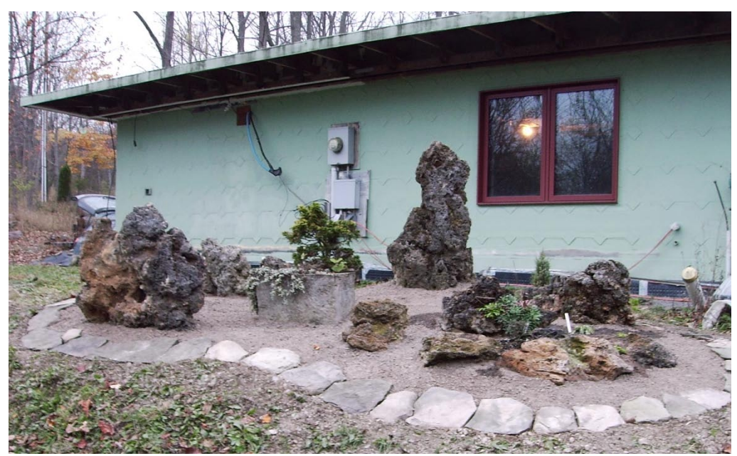
The 24" high disk shaped stone at the front left of the garden has an exquisite through-hole at its top and a smaller through-hole below its center. Through-holes in tufa are typically created when tufa forms around roots or branches that then rot out. Japanese frown at modifying stones, but since I'm an American barbarian, I grabbed a hammer and chisel to enlarge the smaller hole. This often ends in disaster when I'm working with our limestone, but with the tufa, I was able to knock out small chips in a very controlled manner. If you're working with old tufa, the darker surface won't match the lighter interior, so I'd recommend using freshly dug tufa for sculptures and scholar stones. New tufa is also soft until it hardens after exposure to the air.

The tufa Zen garden is a 10 \frac{1}{2} ft by 14 ft oval with seven stone groups and a tall trough. It contains a few plants and gravel but it's mostly 940 lbs of tufa (costing $188). The tufa looks ancient compared to our 375 million year old Devonian limestone, even though it could have been formed only decades ago from spring water that precipitates calcium carbonate among organic materials such as moss . You can choose irregular shapes that look like the mountains in a Chinese scroll painting or an animal or a sculpture. Next to the 39" high pinnacle are stone groups that suggest a whale and a sitting lion. Tall stones were placed in the foreground and background so that they move relative to each other as the viewer walks by. When I relocate these stones to our entry garden, I'll space them further apart.