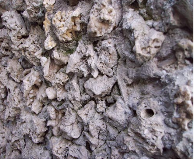
4) We've seen grottos made with tufa all over Europe. The photo (above) shows a close-up of an Italian grotto wall. 2" stones have been pushed into a thick mortar base. I estimate that tufa usage would be about 9 lbs/sqft in this case. Lowes carries a mortar for attaching manufactured stone veneer that would probably work well for a tufa grotto.

Larger pieces of tufa have been mortared together in this grotto at Stourhead in England (left). We've visited walk-in grottos where the tufa was all about 10" in diameter.