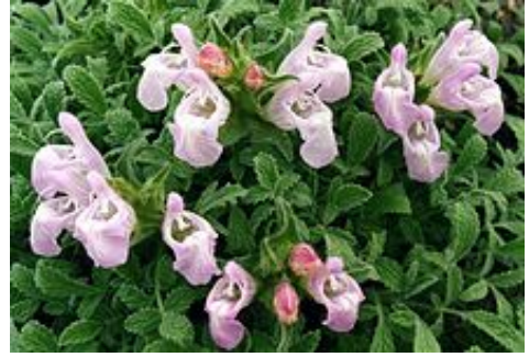
S caespitosa

What is the plant whose seeds are being circulated through NARGS as S.caespitosa ? Your ideas about this mystery plant will be appreciated!