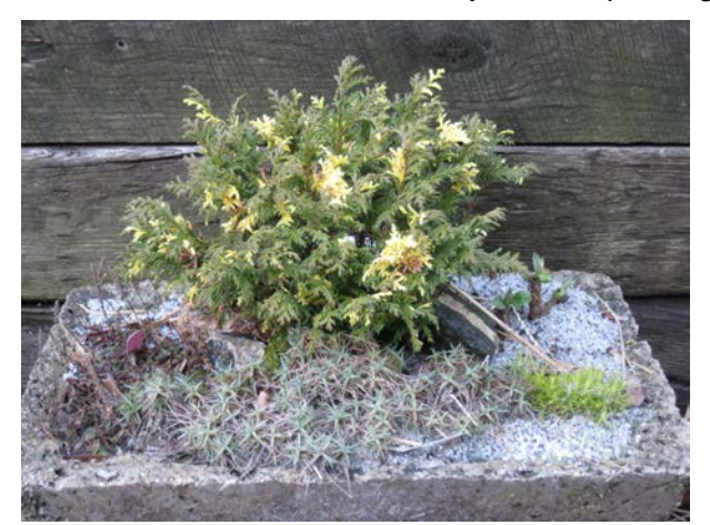
Chamaecyparis pisifera 'Gold Dust' sharing a trough with a dianthus & other plants

Trees may be artificially dwarfed, as in the bonsai displays made famous by the Japanese. This technique will not work well in a trough because we provide too much soil and room for root growth. However, a certain amount of judicious pruning may be very helpful on occasion. Dwarf conifers must