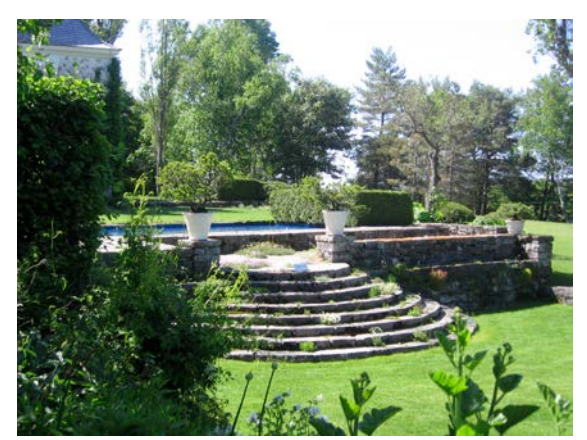
The stone steps serve to provide perfect planting spaces for choice rock garden gems.

A number of us were privileged to receive a personal tour from Frank in 2007. We'll follow the viewing of the DVD with spontaneous personal recollections to share. Cabot's former residence, now a public garden, is Stonecrop in Cold Spring, NY.