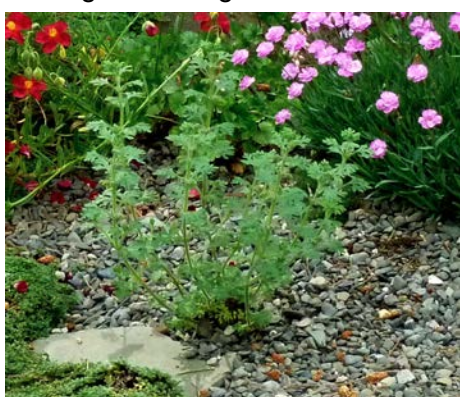
"Salvia biennial", plant obtained at May 2011 sale in Nari's rock garden with Helianthemum num. & Dianthus gratianopolitanus in background.)

In contrast, Wikipedia (below) and Harvey Wrightman show pictures of the true S. caespitosa , that has quite different leaves and flowers, more like true Salvia!