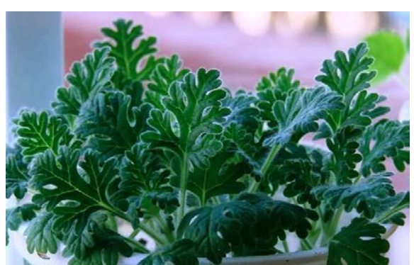
Salvia or Not Salvia? That is the question.

At the May 2011 plant sale I found a small plant labeled "Salvia biennial" which looked very much like