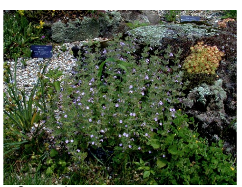
S.caespitosa, Smith College botanic guide

The plant did bloom with small pink flowers, looking exactly like a picture shown as S. caespitosa on the Smith College botanic guide (see below)!