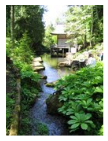
A peak at 1 of the teahouses at Les Quatre Vents

Cabot's first garden was Stonecrop and our chapter will visit that garden on April 28<sup>th</sup>. If anyone wants to be added to that trip, please let me know by email bji1@cornell.edu. Garden builders never stop. Frank was building a new garden in New Zealand when he passed away.